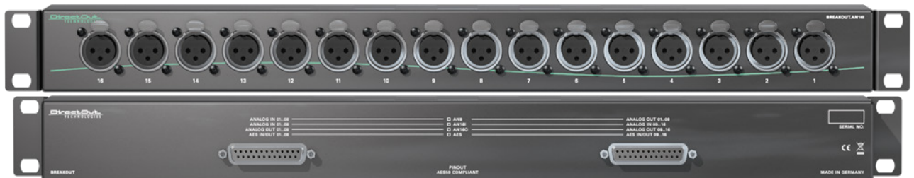
BREAKOUT.AN16I - analog input, 16 channels Article code: DOBOB0890