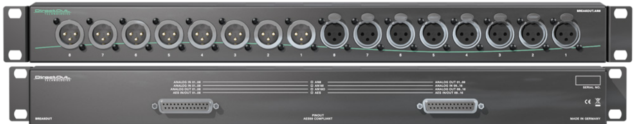
BREAKOUT.AN8 - analog input / output, 8 channels Article code: DOBOB0889

The small form factor and angle brackets also allow for mounting the devices on the back of an ANDIAMO or PRODIGY unit.