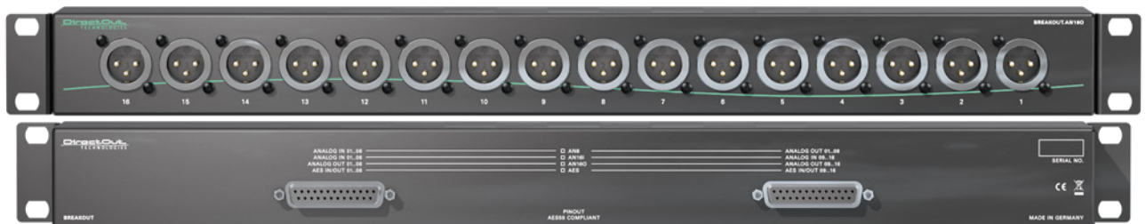
BREAKOUT.AN16O - analog output, 16 channels Article code: DOBOB0891