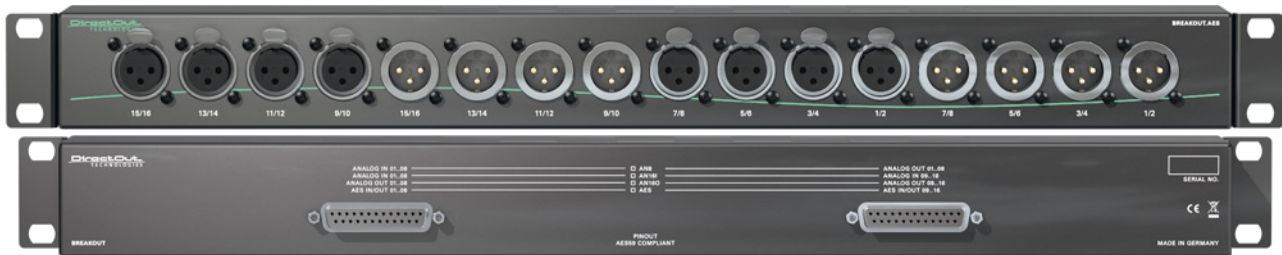
BREAKOUT.AES- digital input / output, 8 AES3 ports (16 channels) Article Code: DOBOB0887