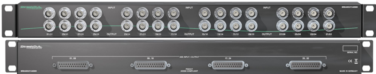
BREAKOUT.AESID- digital input / output, 16 AESid ports (32 channels) Article Code: DOBOB0888